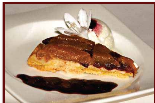
Apple Tarte Tatin....$6. 95 Upside Down Carmelized Apples