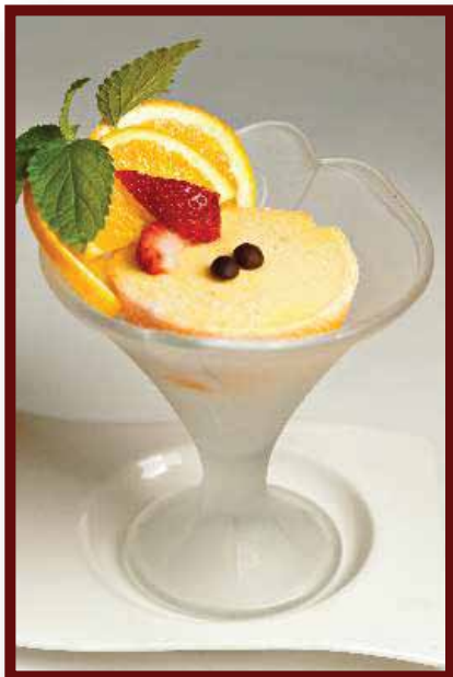
Orange Sorbet....$6. 95 Light & Refreshing, Full of Citrus Zest