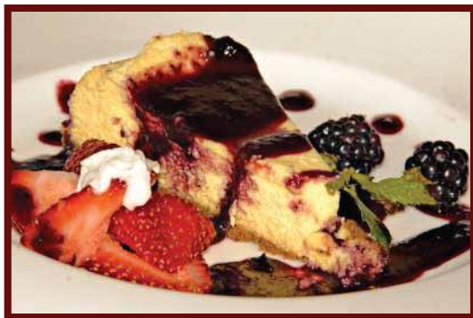
New York Cheese Cake....$6. 95 Cheese Cake on a Traditional Graham Crust