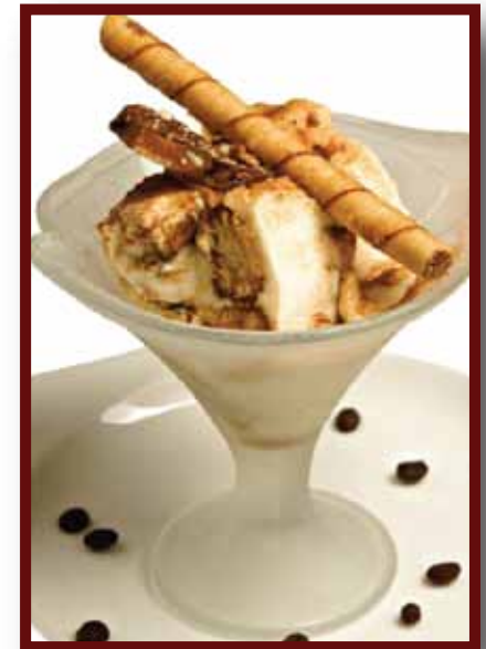
Tiramisu....$6. 95 Lady Fingers, Mascarpone Cheese & Coffee Base