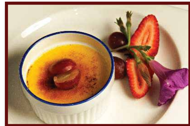
Creme Brulee....$6. 95 With a Hint of Grand Marnier