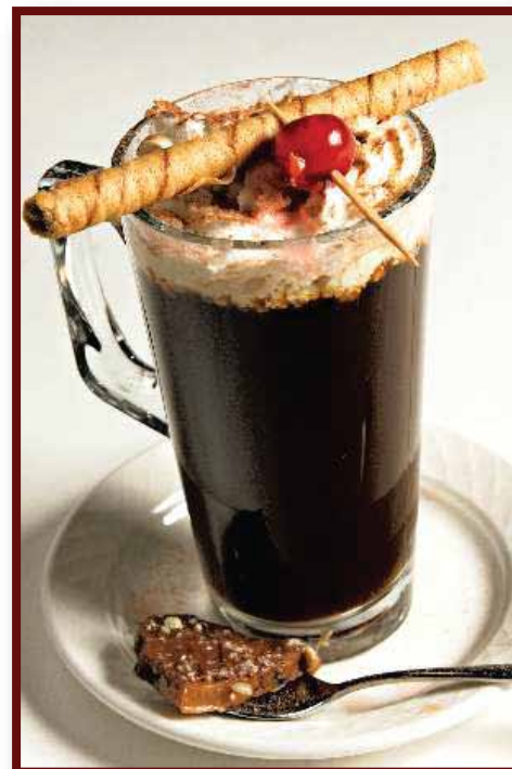
Coffees Cappuccino, Latte....$3. 50 Espresso....$2. 50