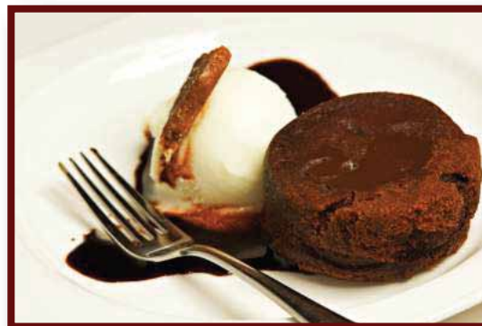
Chocolate Lava Cake....$6. 95 Made W/Lindt Chocolate, Served W/Vanilla Ice Cream