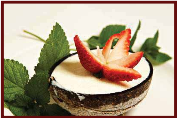
Coconut Sorbet....$6. 95 Velvety Smooth, Served in a Coconut Shell